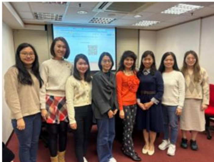
Photo1: WHSG Ex committee

As the Hong Kong Physiotherapy Association (HKPA) approaches its 62 nd anniversary, we take this opportunity to reflect on the important work being done by its Women's Health Specialty Group (WHSG). With a membership count of 2,860, including 40 dedicated physiotherapists focusing on women's health issues, WHSG plays a crucial role in enhancing the quality of physiotherapy services provided to women in Hong Kong.