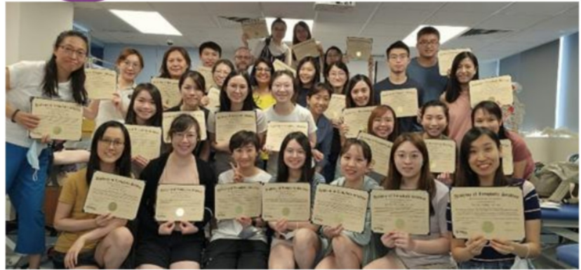
Photo 2. 30 physiotherapists attaining certification as lymphedema therapists